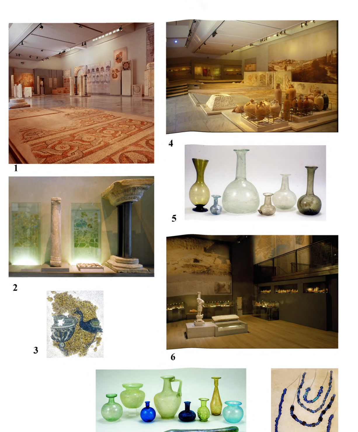
Fig. 1,1 – Permanent Exhibition: Early Christian Church; 2 – Window Panes, Philippi, 6<sup>th</sup> c.; 3 – Wall Mosaic, 5<sup>th</sup> c.; 4 – Permanent Exhibition: Early Christian Cities and Private Dwellings; 5 – Glass Vessels 4<sup>th</sup>-6<sup>th</sup> cc.; 6 – Permanent Exhibition: From the Elysian Fields to the Christian Paradise; 7 – Glass Vessels 4<sup>th</sup>-6<sup>th</sup> cc.; 8 – Glass Jewelry 4<sup>th</sup>-5<sup>th</sup> cc.